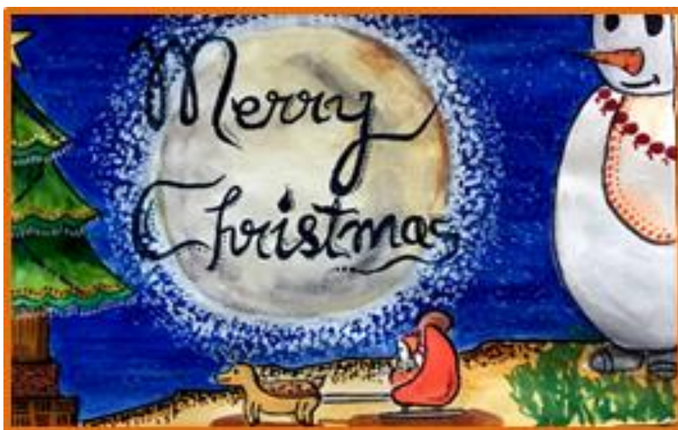
~ Riva Shah (X-B)